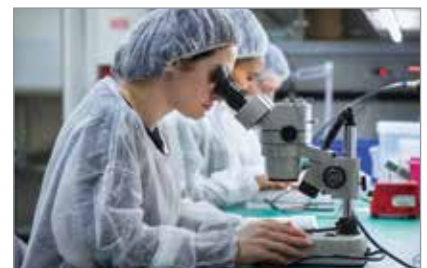
Assembly and inspection of precision parts