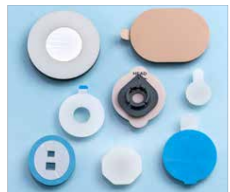
Die-cut or moulded components

Electrodes & Sensors • Textiles & Fabrics • Velcro & Scotch Fasteners • Medical Adhesive Tapes • Gaskets & Foams