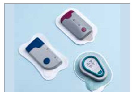
Skin fixation solutions for custom devices