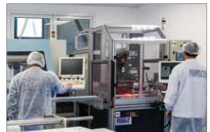
Automated clean room production line