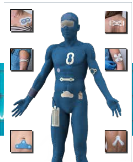
Skin fixation solutions